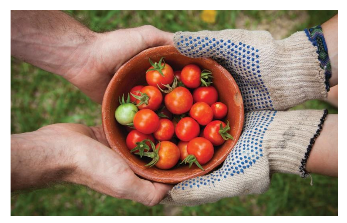
SLAB provides accreditation for certification bodies conducting audits for organic agriculture.

'Organic agriculture' is certainly the hottest topic in Sri Lanka as of today.